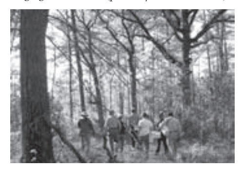
Wednesday, December 2 Field Trip: Turkey Creek Trail in the Clemson Forest

*Unlike in the past, SCNPS cannot help with lodging this year. We will locate inexpensive lodging near the site (probably Moncks Corner).