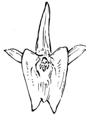
Illustration by Gordon Morrison.